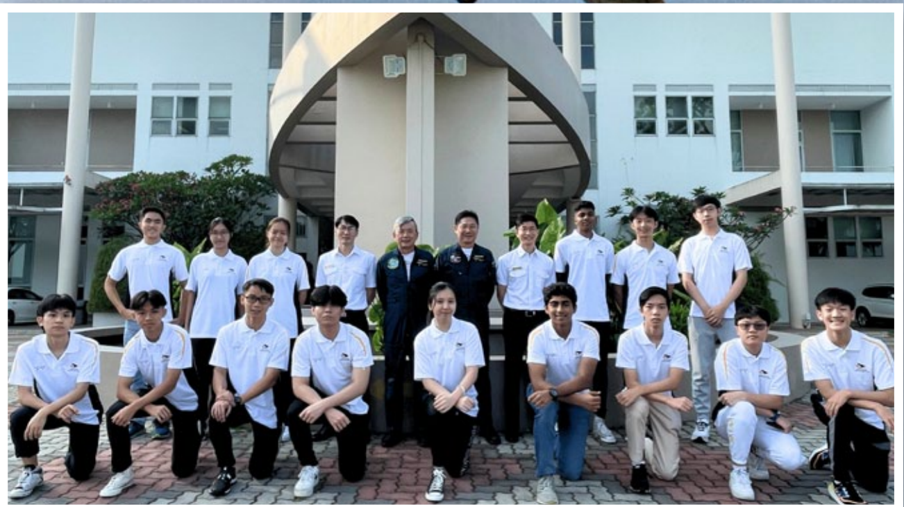
BFC 282 Started on 3 Jun 23 with 15 students onboard.