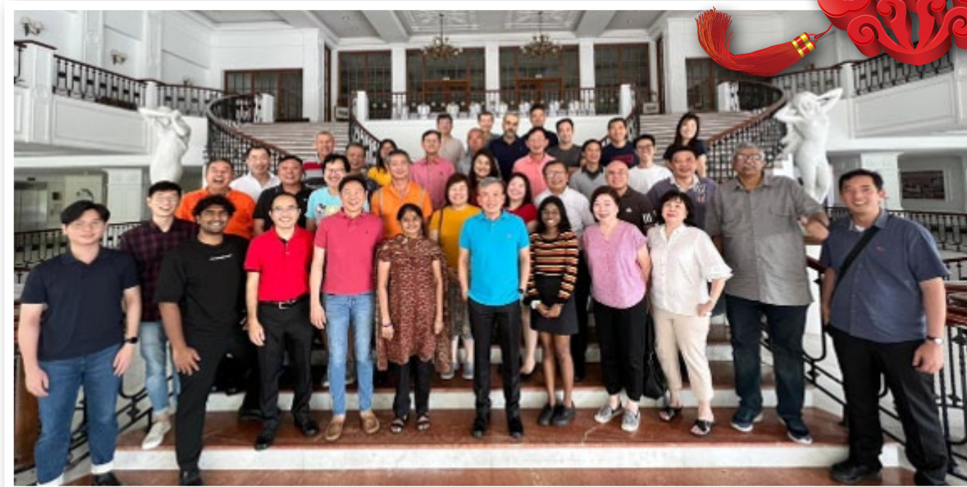
SYFC staff celebrated the Chinese New Year with a 'Lohei' lunch at Ban Heng @Orchid Country Club on 2 Feb 23.