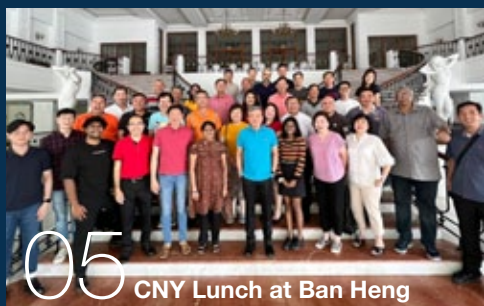
05 CNY Lunch at Ban Heng