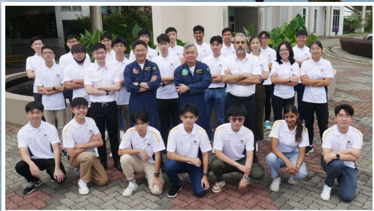
BFC 279 started on 25 Feb 23 with 25 students onboard.