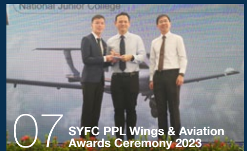
07 SYFC PPL Wings & Aviation Awards Ceremony 2023