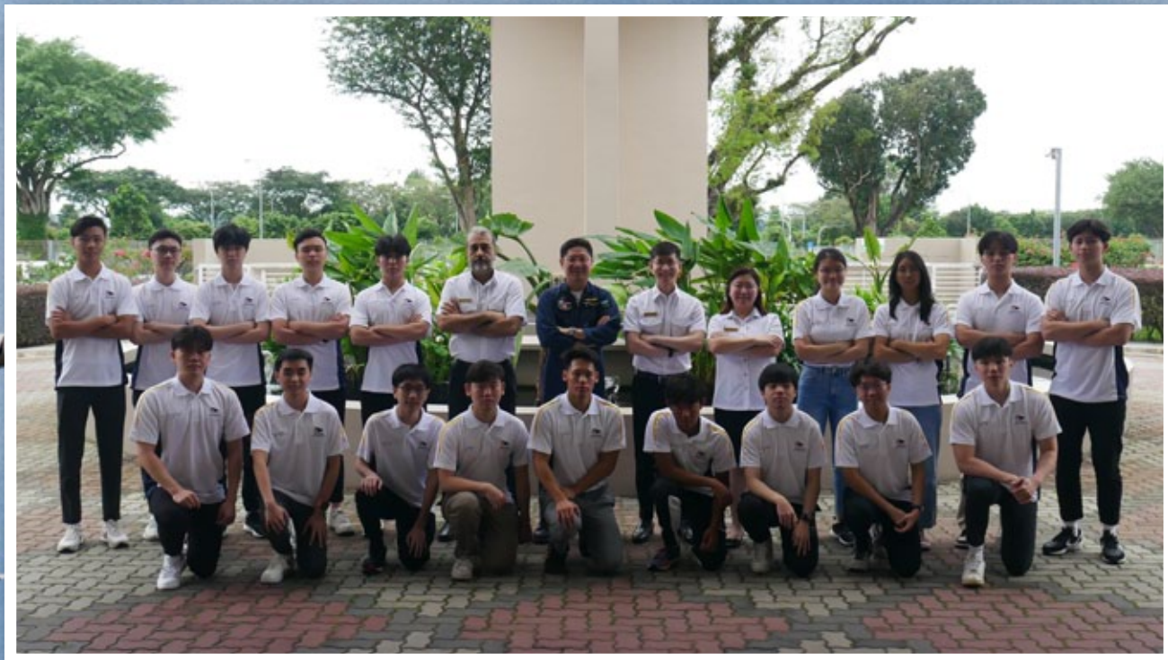
BFC 278 started on 28 Jan 23 with 18 students onboard.