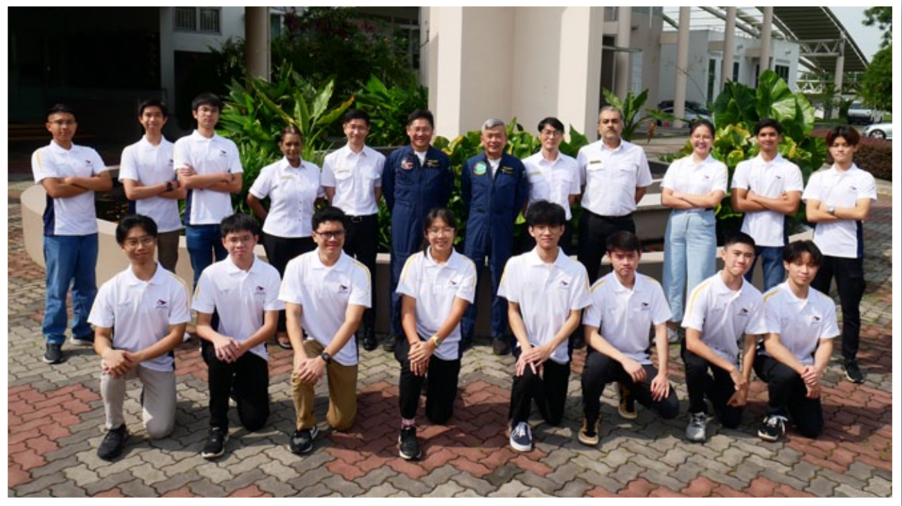
BFC 281 started on 6 May 23 with 14 students onboard.