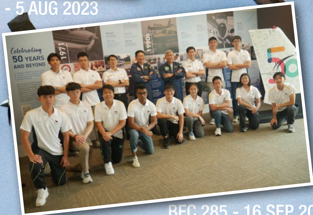
BFC 285 - 16 SEP 2023