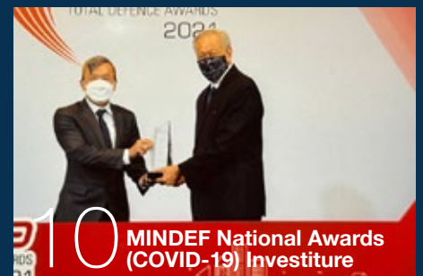
10 MINDEF National Awards (COVID-19) Investiture