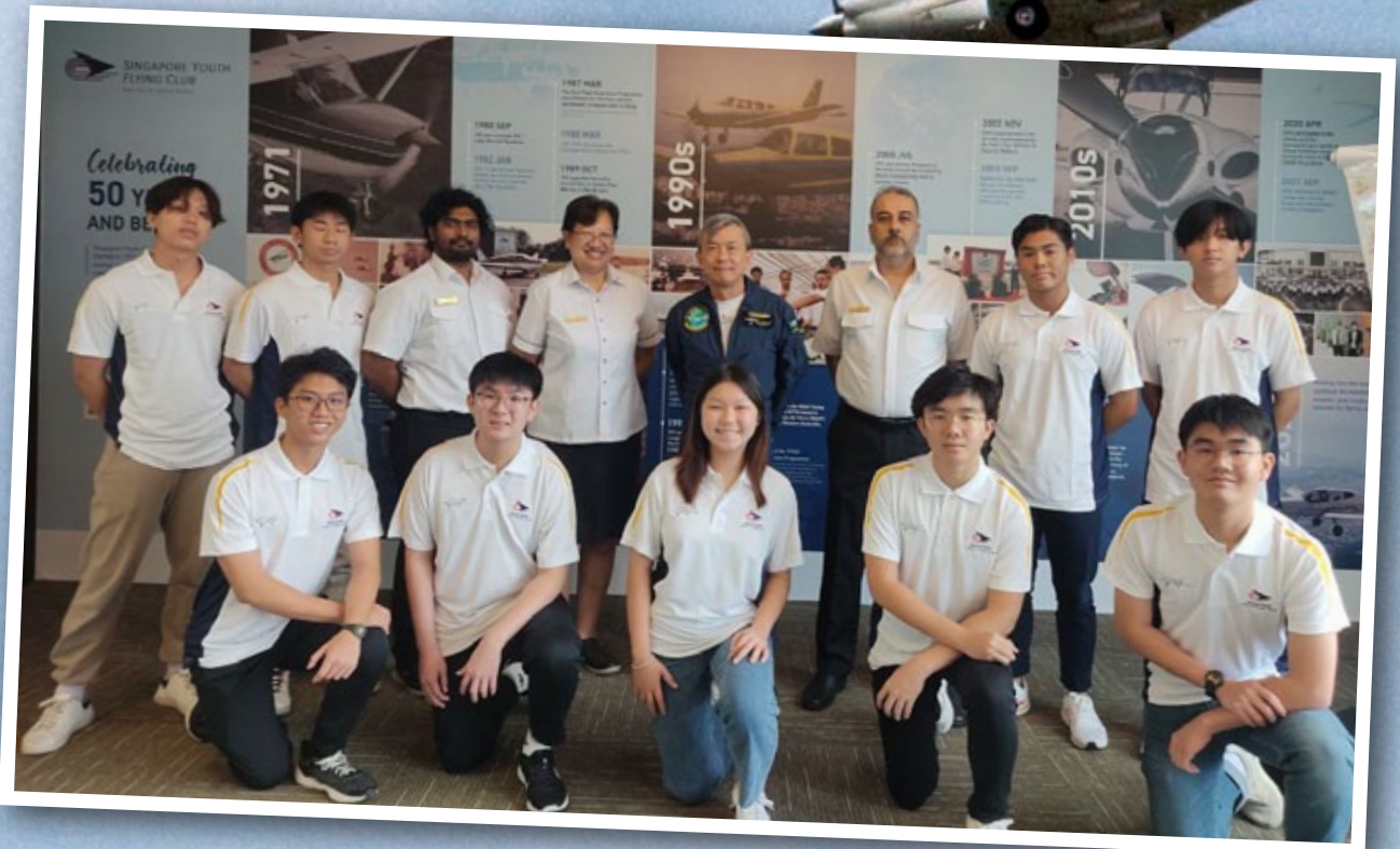
BFC 288 - 9 DEC 2023