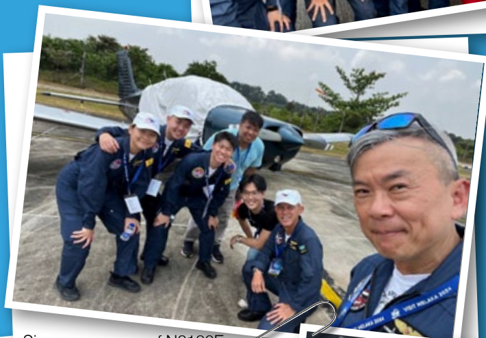
Singapore owner of N2180E