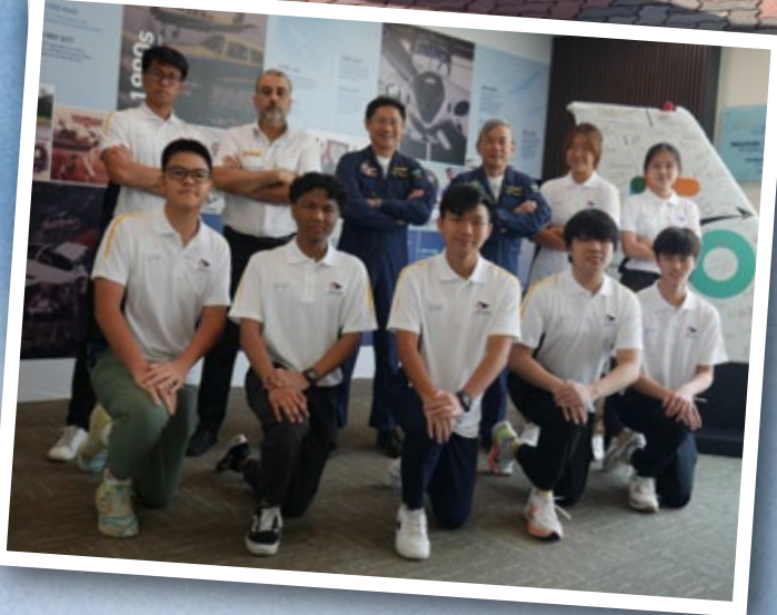
BFC 284 - 5 AUG 2023