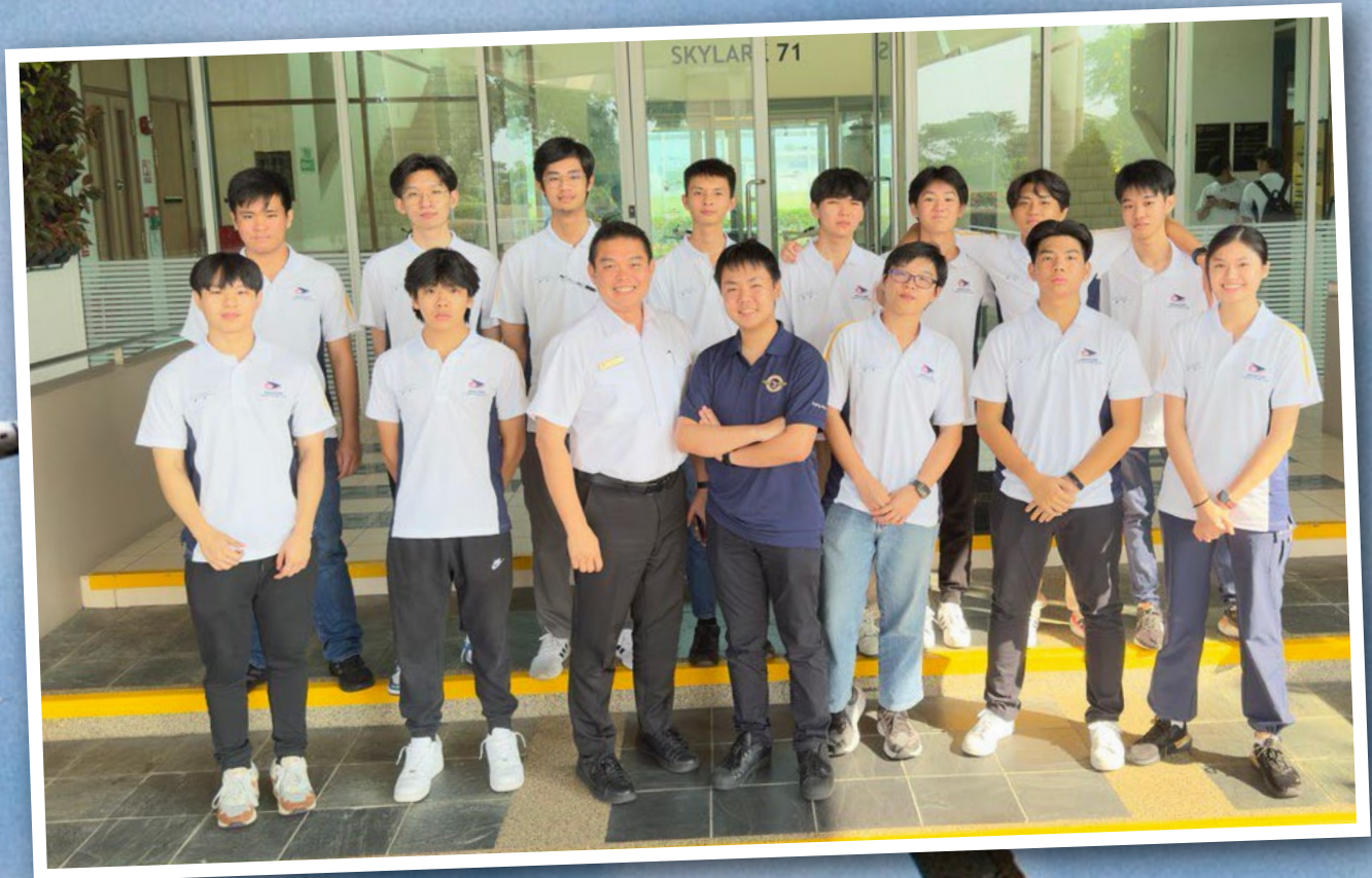
BFC 287 - 11 NOV 2023