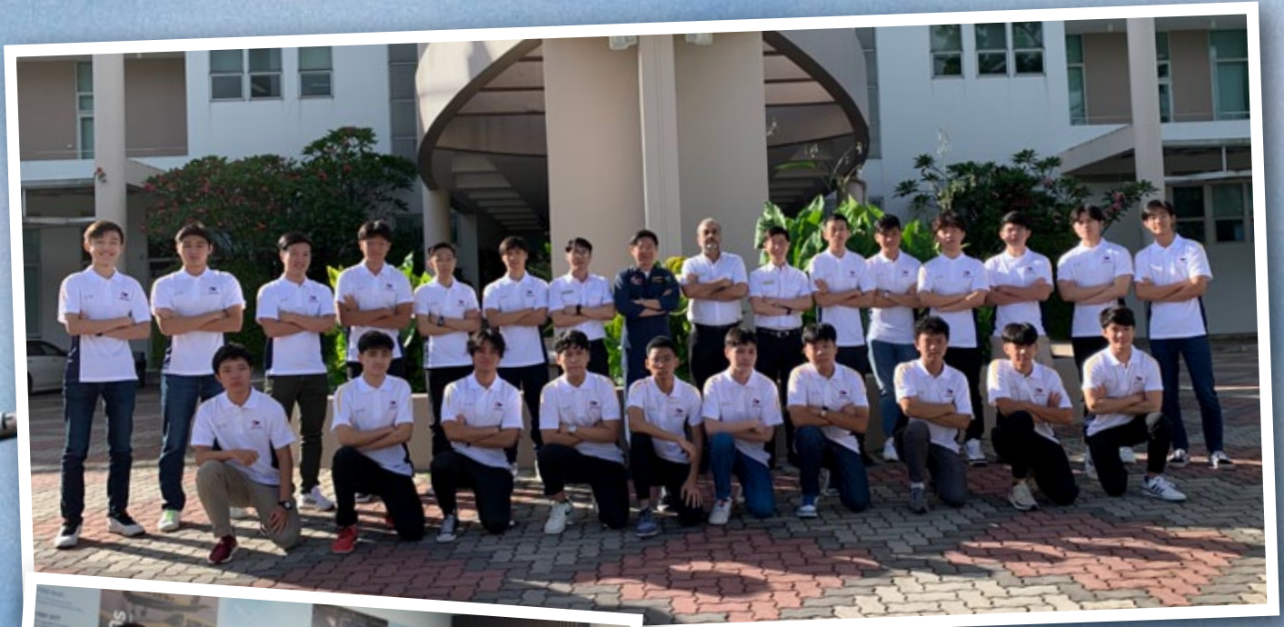
BFC 283 - 1 JUL 2023