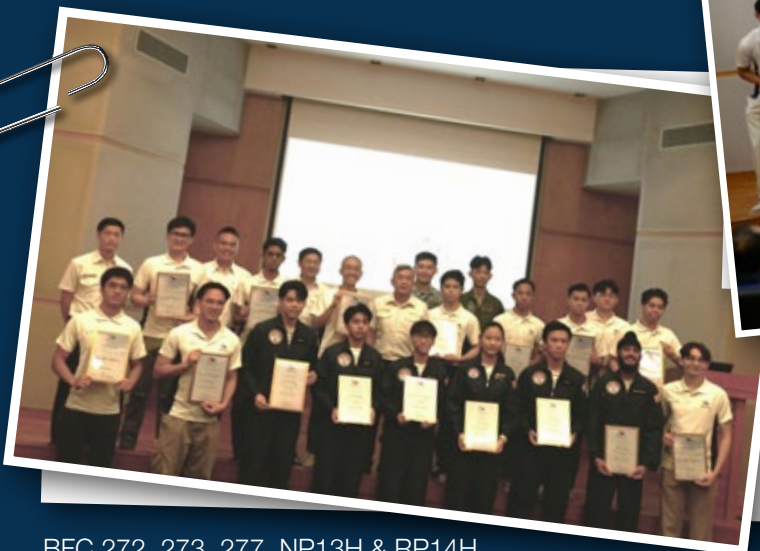
BFC 272, 273, 277, NP13H & RP14H.