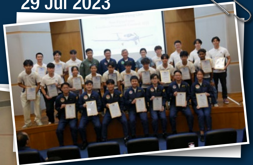
BFC 270, 271, TP35H-22, NP14H-22, RP15H-22.