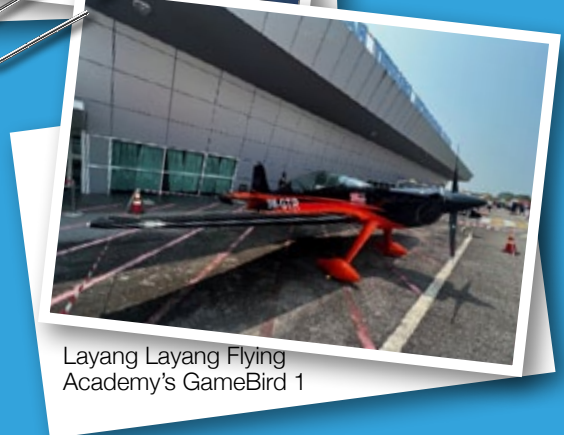
Layang Layang Flying Academy's GameBird 1