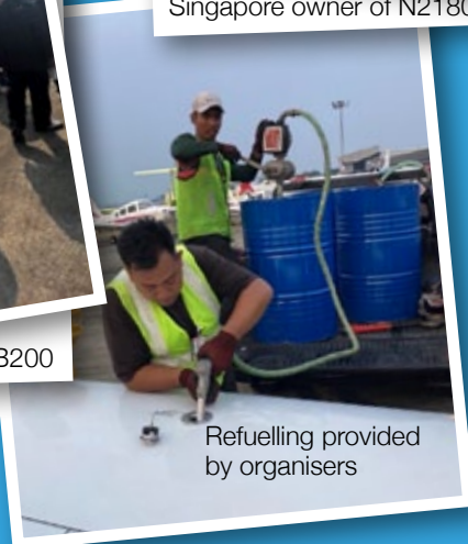
Refuelling provided by organisers