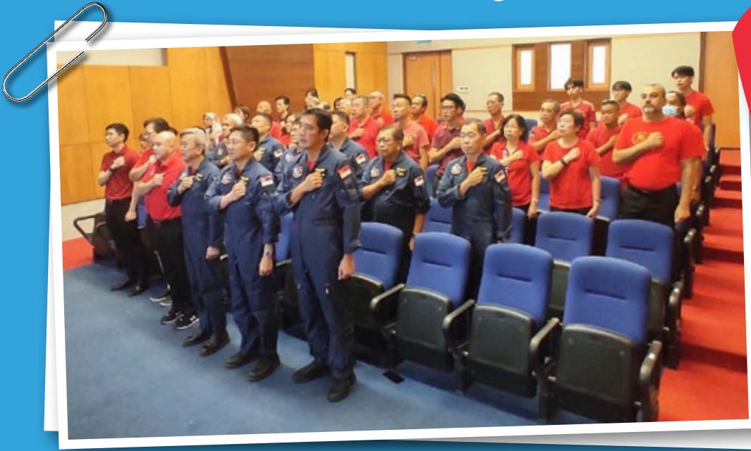
SYFC held our National Day Observance Ceremony on 8 Aug 2023 to celebrate Singapore's 58th birthday.