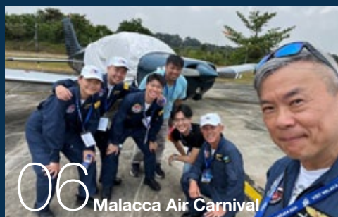
06 Malacca Air Carnival